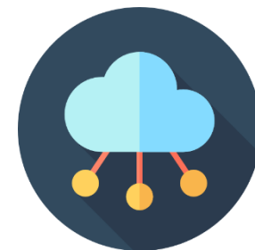
Internet of Things