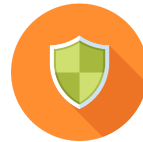
Cyber Security Black Listing GDPR