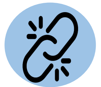
Mission Critical & Business Critical

Purchase advantage/ Hardware/ Software/Expense mgmt/RFP Advise