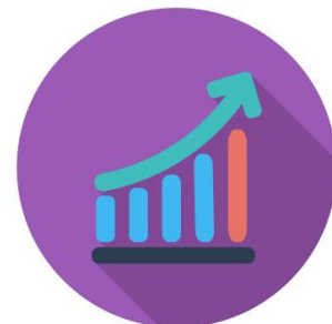
Data Analytics Science